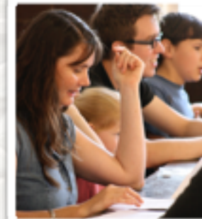
Training youth leaders

"For he has rescued us from the dominion of darkness and brought us into the kingdom of the Son he loves." Colossians 1:13