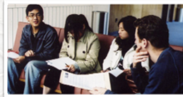
Leading bible study on campus at the University of NSW